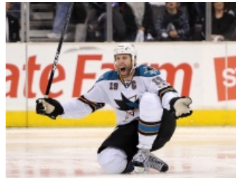
San Jose Sharks 2011 Playoff Run