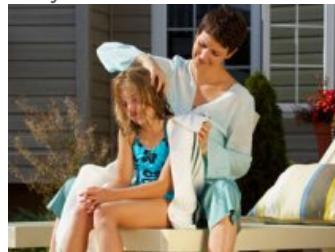
Mother's Day Guide