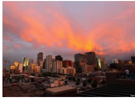
The 10 Cities Where Americans Most Want To Live: Harris Interactive