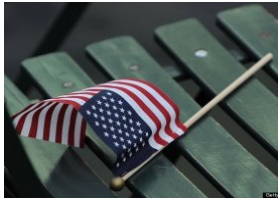
The States Doing The Most (And Least) To Spread The Wealth: 24/7 Wall St.