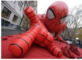
The Most Valuable Movie Franchises Of All-Time: 24/7 Wall St.