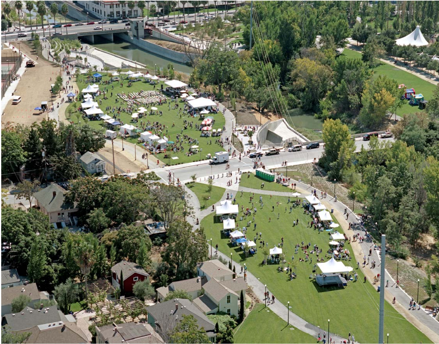
Guadalupe River Park